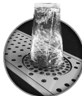
Integrated water glass rinser