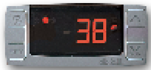
Adjustable Digital Thermostat! Easy to read exterior mounted